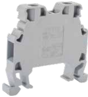
MRK 4 New Code: 1010022 Old Code: 1022