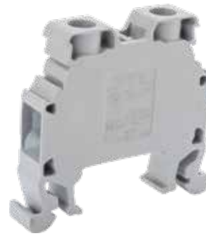
MRK 6 New Code: 1010032 Old Code: 1032